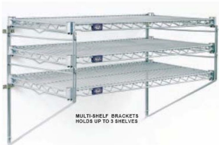
MULTI-SHELF BRACKETS HOLDS UP TO 3 SHELVES

P erfect for creating wall storage area where floor space isn't available. One pair of wall brackets is required per shelf. Select either Single Shelf Brackets or Multi-Shelf Brackets. Multi-Shelf brackets hold up to 3 shelves (with 4" clearance between shelves) 22" high overall. Chrome finish.