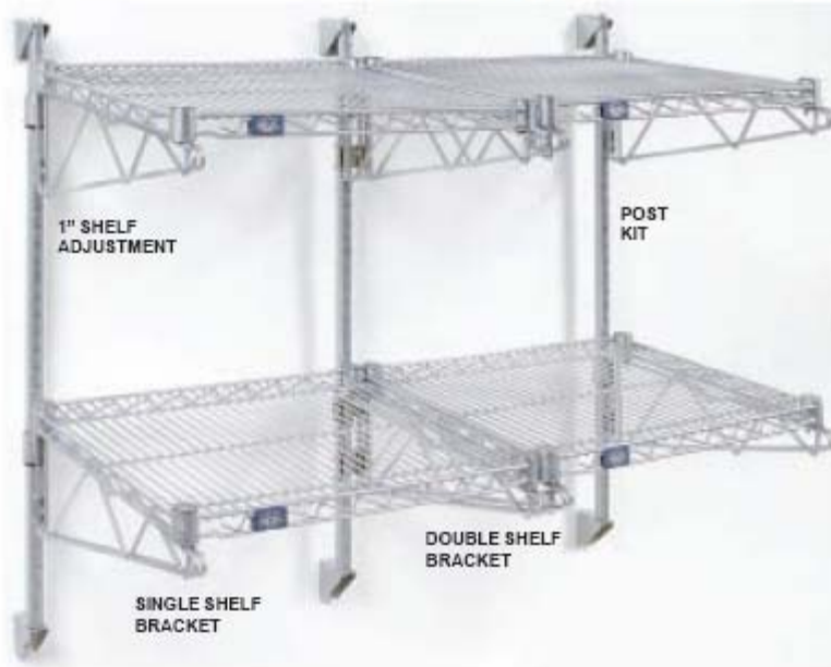
1" SHELF ADJUSTMENT