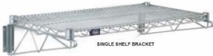
SINGLE SHELF BRACKET

P erfect for creating wall storage area where floor space isn't available. One pair of wall brackets is required per shelf. Select either Single Shelf Brackets or Multi-Shelf Brackets. Multi-Shelf brackets hold up to 3 shelves (with 4" clearance between shelves) 22" high overall. Chrome finish.